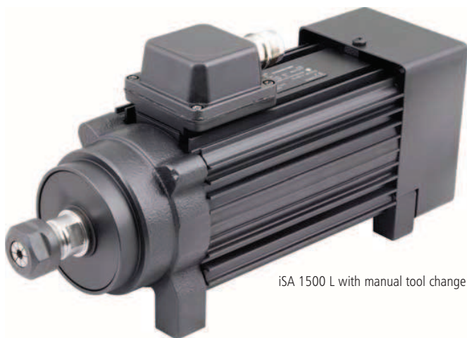
iSA 1500 L with manual tool change